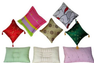
Ornamental Pillow - 22,5 - 45 ron