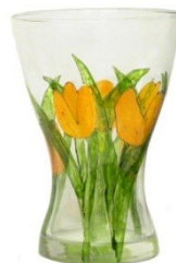
Glass Vase - 44 ron