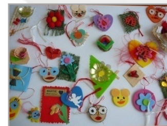
“Mărțișor” - 6 ron