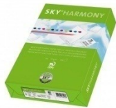
A4 Paper - 14,31 ron