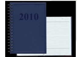
Agenda - 16,92 ron