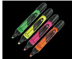
Textmarker - 3,38 ron / buc