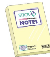
Post-it - 1,82 ron