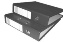
Files Folder - 6,28 ron / buc