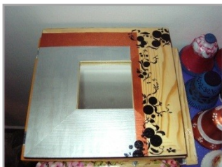
Foto Frame - 50 ron