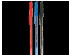
Pencil - 0,7 ron / buc