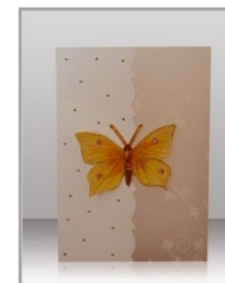
Card - 6 ron