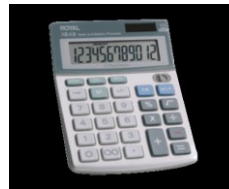
Office Calculator - 29,86 ron